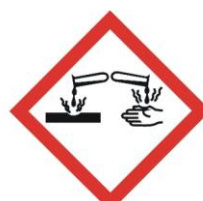
Corrosive to metals