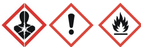
Aspiration hazard Skin irritation Flammable liquids