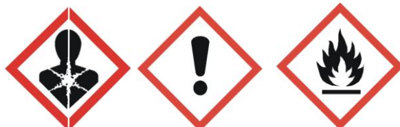
Aspiration hazard Skin irritation Flammable liquids