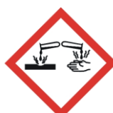
Corrosive to metals